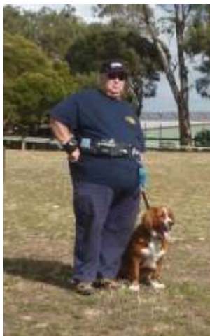
Some of the dogs strutting their stuff...