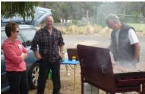
Busy at the BBQ with El Pres!