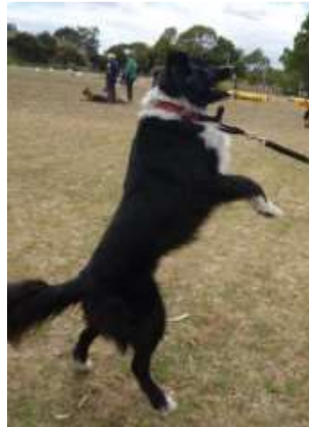
Let's Play Ball!