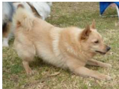
I Wanna Play Too!