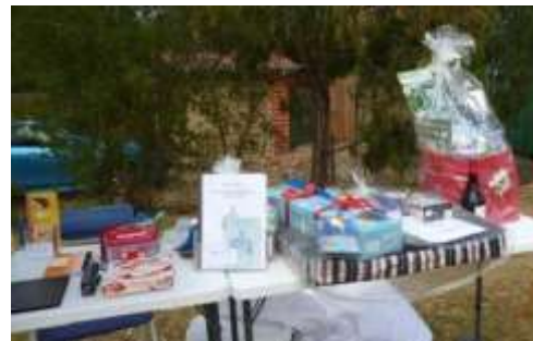
The Raffle Table - Well Done Janice!