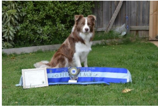
Highest Scoring OPEN & Highest BORDER COLLIE - SHAUN GENTLE & BARNEY (187)