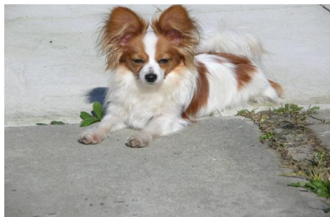
Highest Scoring RALLY - GAYLE BAXTER & KODA (99)