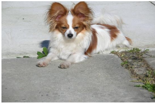
GAYLE BAXTER with KODA