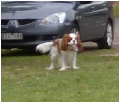
Highest Scoring CCD - JULIE CONROY & LUCY (98)