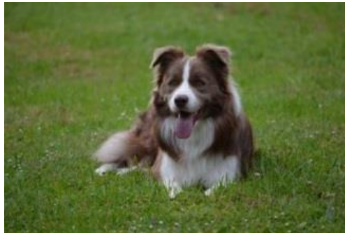
SHAUN GENTLE with BARNEY